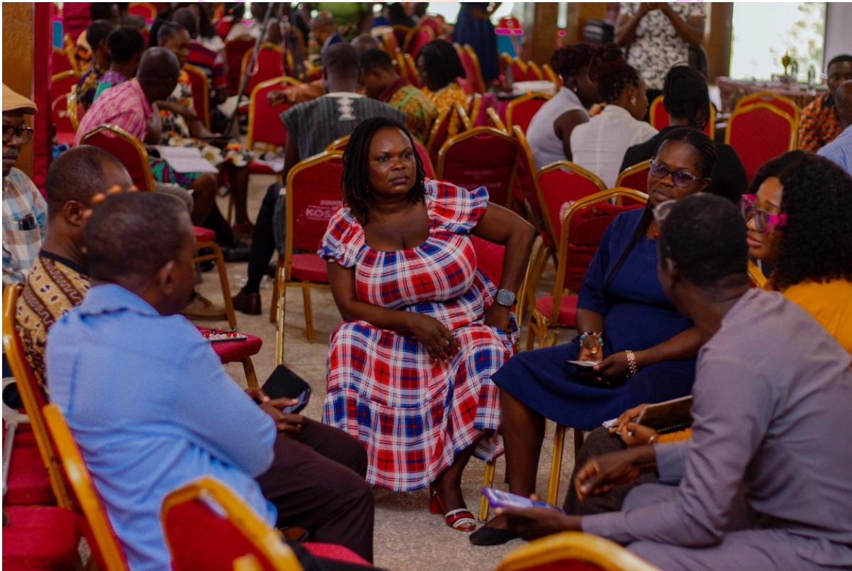
Participants engage in their group discussions